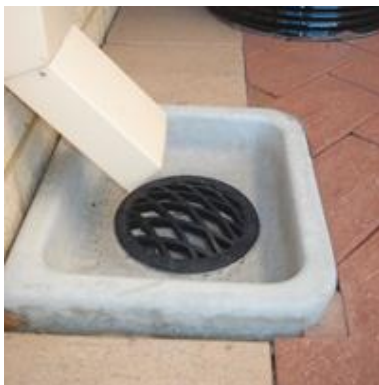
Figure 4 Example of a stormwater grate referred to in 5.1.7