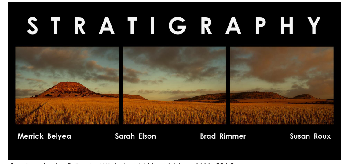
Stratigraphy, Art Collective WA Artists, 14 May - 26 June 2022, GRAG.