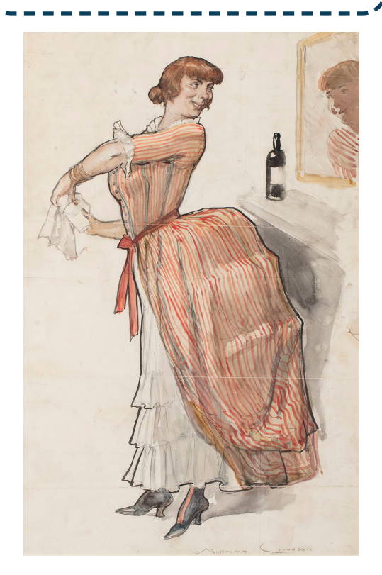
Norman Lindsay, My Reflection , c1910, Watercolour on paper, 40 x 36cm (CGG Ac. No. 182).

Improve, promote and conserve the City of Greater Geraldton Art and Public Art Collections.