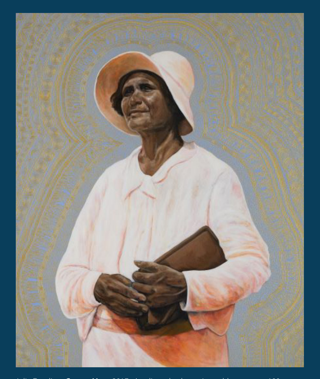
Julie Dowling, Granny Mary , 2017, Acrylic, red ochre, mica gold on canvas, 100 \times 120 \text{cm} (CGG Ac. No. 503).