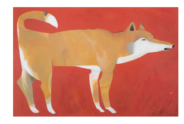
Moira Court, Howl , 2011, Acrylic, wax oil, pastel and charcoal on canvas, 101 x 152cm (CGG Ac. No. 453).

Contribute to the vibrancy of the City of Greater Geraldton and the quality of life in regional Western Australia, attracting visitation and economy to the Midwest region.