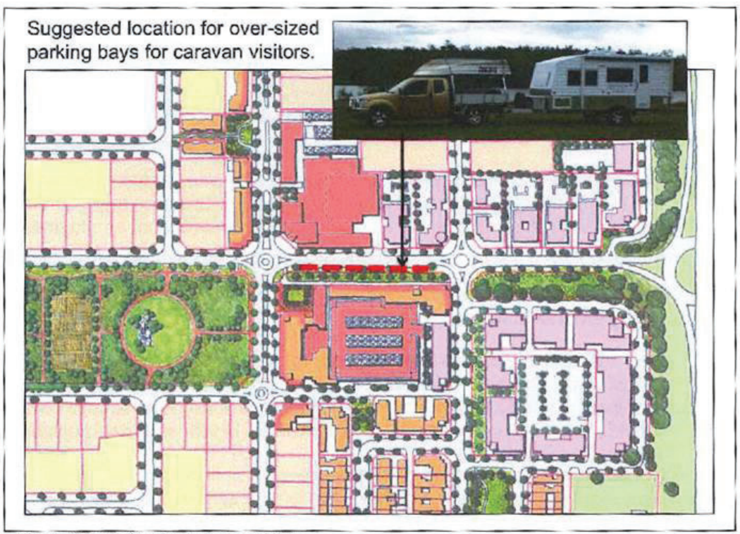
Figure 20: Visitor bays for caravans