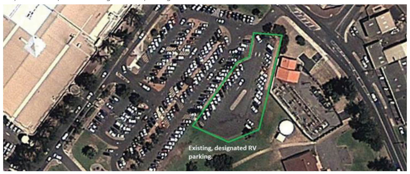
2.3.2. The Sunset Beach Precinct Plan includes designated parking for oversized vehicles and caravans. See Map 3.