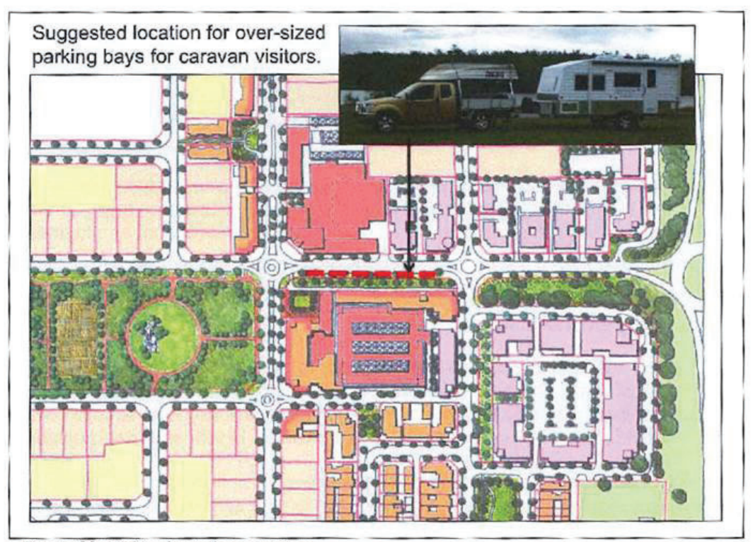
Figure 20: Visitor bays for caravans