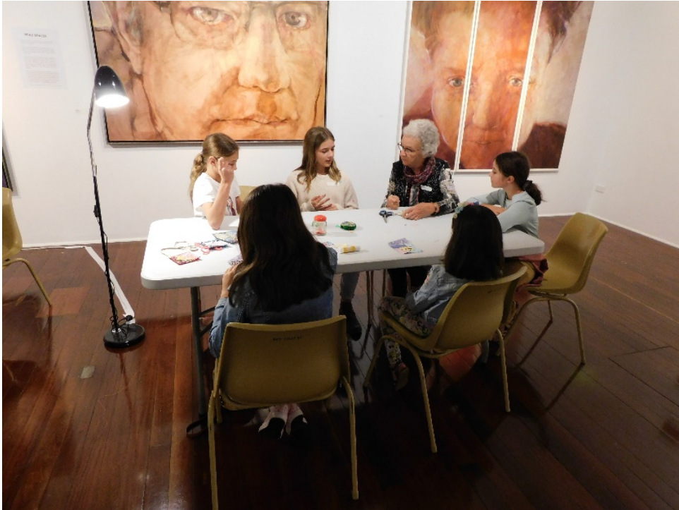
School Holiday Workshop during IOTA21