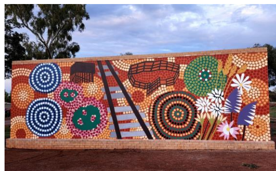
Mullewa Entrance Mural by local Artists, 2022