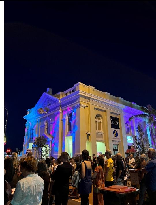
Mid West Art Prize, Gala Opening Night, 27 November