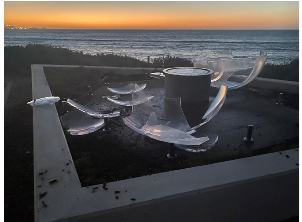
Horizon Sculpture on Geraldton Foreshore, 4 December