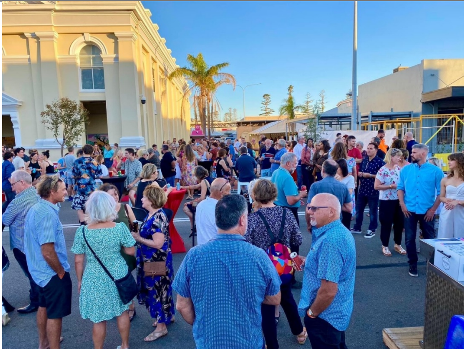
Mid West Art Prize, Gala Opening Night, 27 November