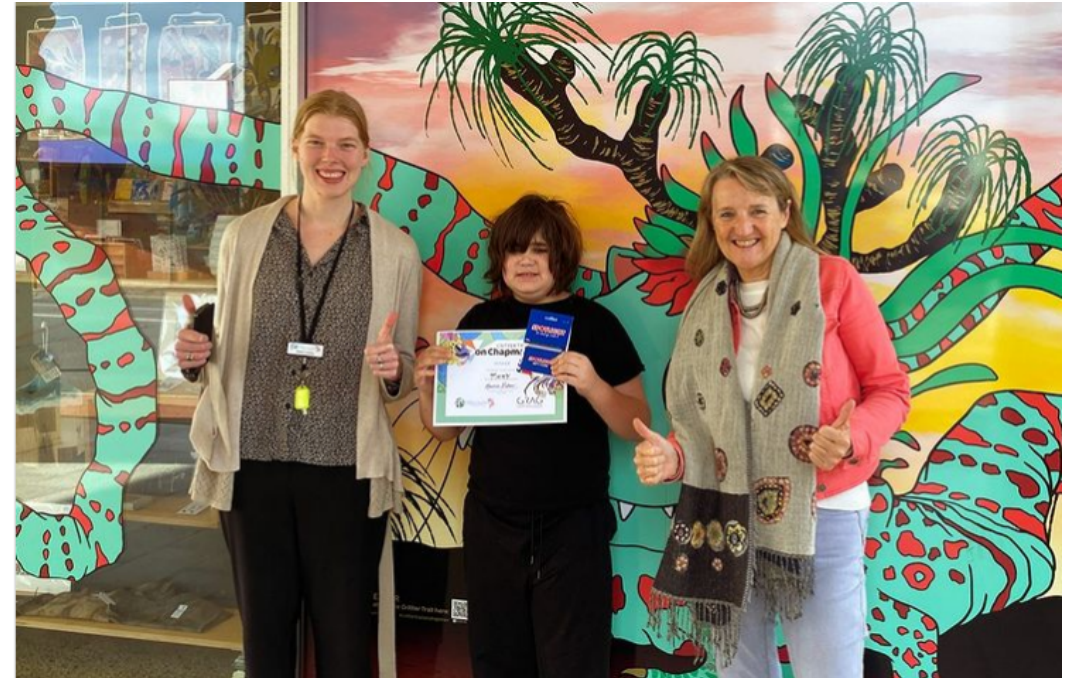
Critter Trail and a prize winner (centre) with Gallery staff