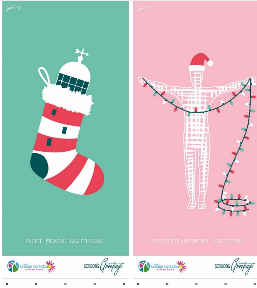
Two of the Season's Greetings Banner designs