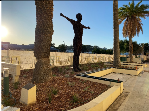
Sun rising over Protected Memories by April Pine and new GRAG garden development