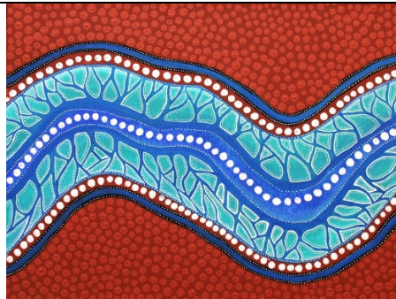
External Gallery, Post Office Lane Lightbox Gallery – River, Ocean & Sky by Nicole Dickerson