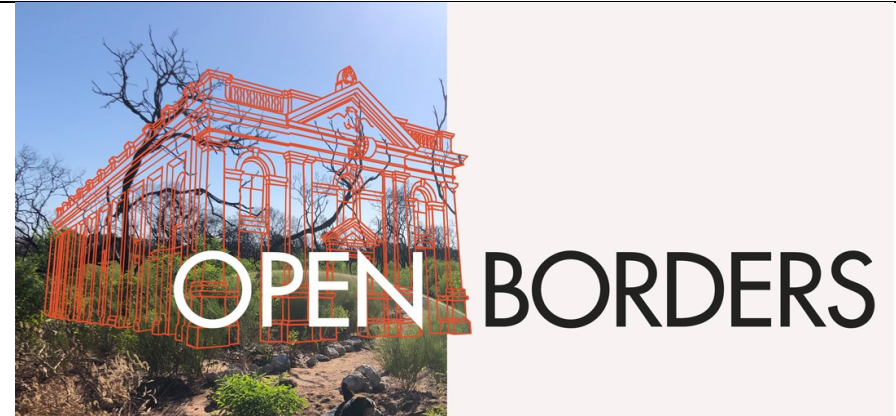
Locally curated exhibition Open Borders , planning work undertaken from early in 2022, with opening date set for 8 July 2022.