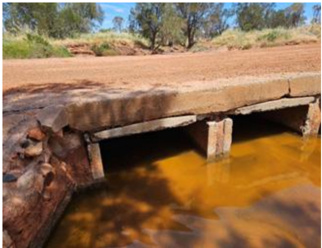
Wongoony - Tardun Road Culvert Replacement