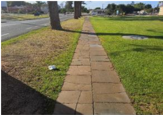
Durlacher Street Footpath Renewal