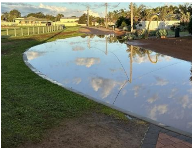
Casuarina Close Sump & Drainage Upgrades