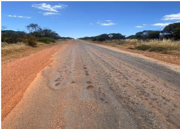
Sutherland Road Reseal