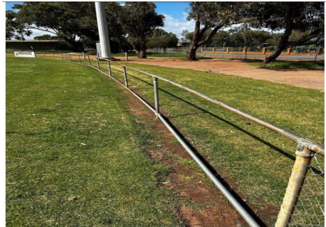
Greenough Oval Sports Fencing Renewal