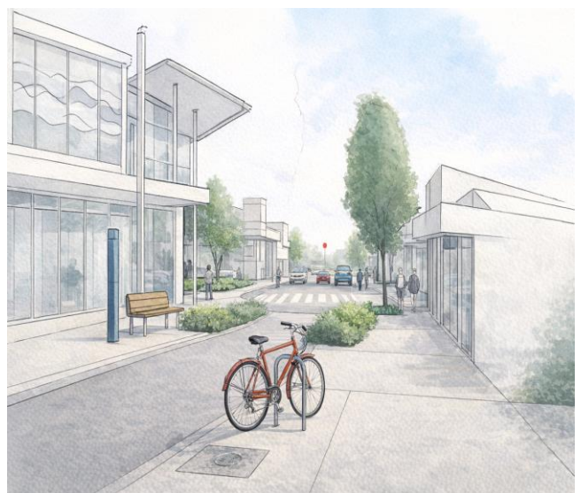
Chapman Road Streetscape Upgrade