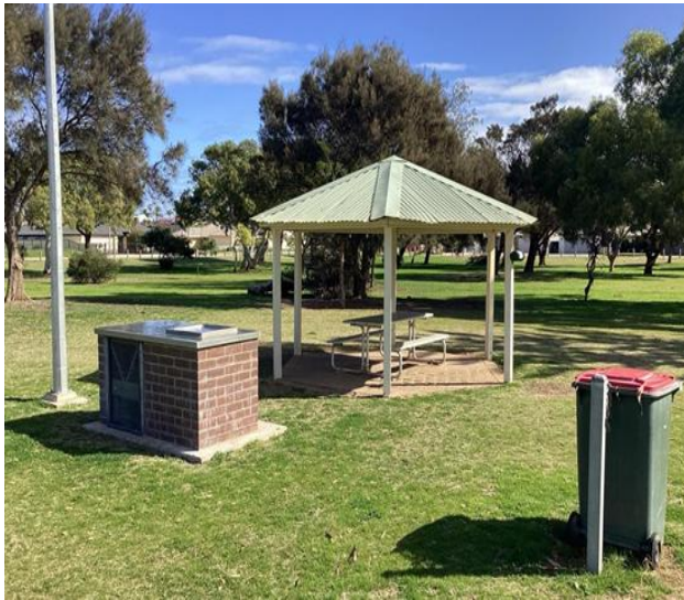
Bayside Park Gazebo Hardstand Renewal