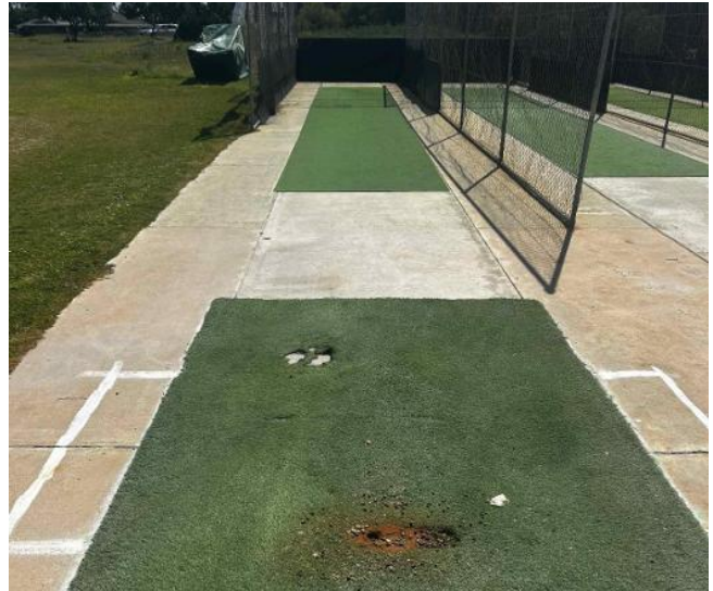
Muir Park Cricket Nets Renewal