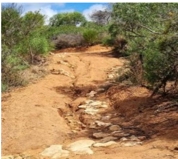
Chapman River Regional Park Loop Trail Renewal