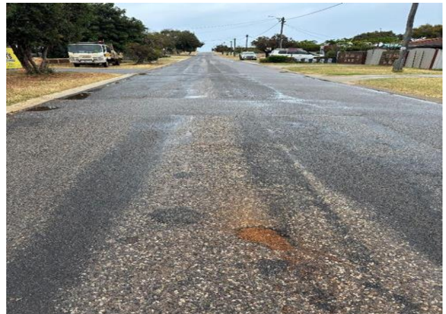
Trigg Street Renewal