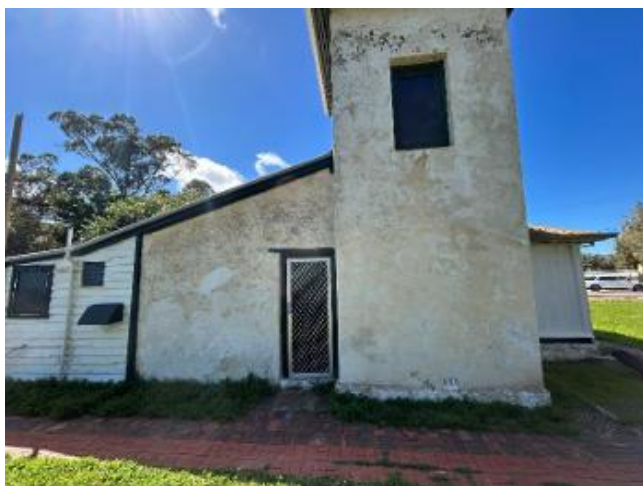
Lighthouse Keepers Cottage Renovation