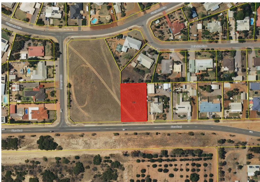
Location plan for Lot 156 (No. 331) Place Road, Strathalbyn.

Lot 156 is situated to the east of the currently undeveloped commercial zoned lot and is bound to the north and east by existing residential development which consists of predominantly single houses developed to a Residential R5 (2,000m 2 ) density. On the southern side of Place Road is a 'Public Purpose' local scheme reserve for the Geraldton No. 2 Waste Water Treatment Plant (WWTP). Lot 156 is not affected by the general WWTP buffer depicted in the City's Local Planning Strategy.