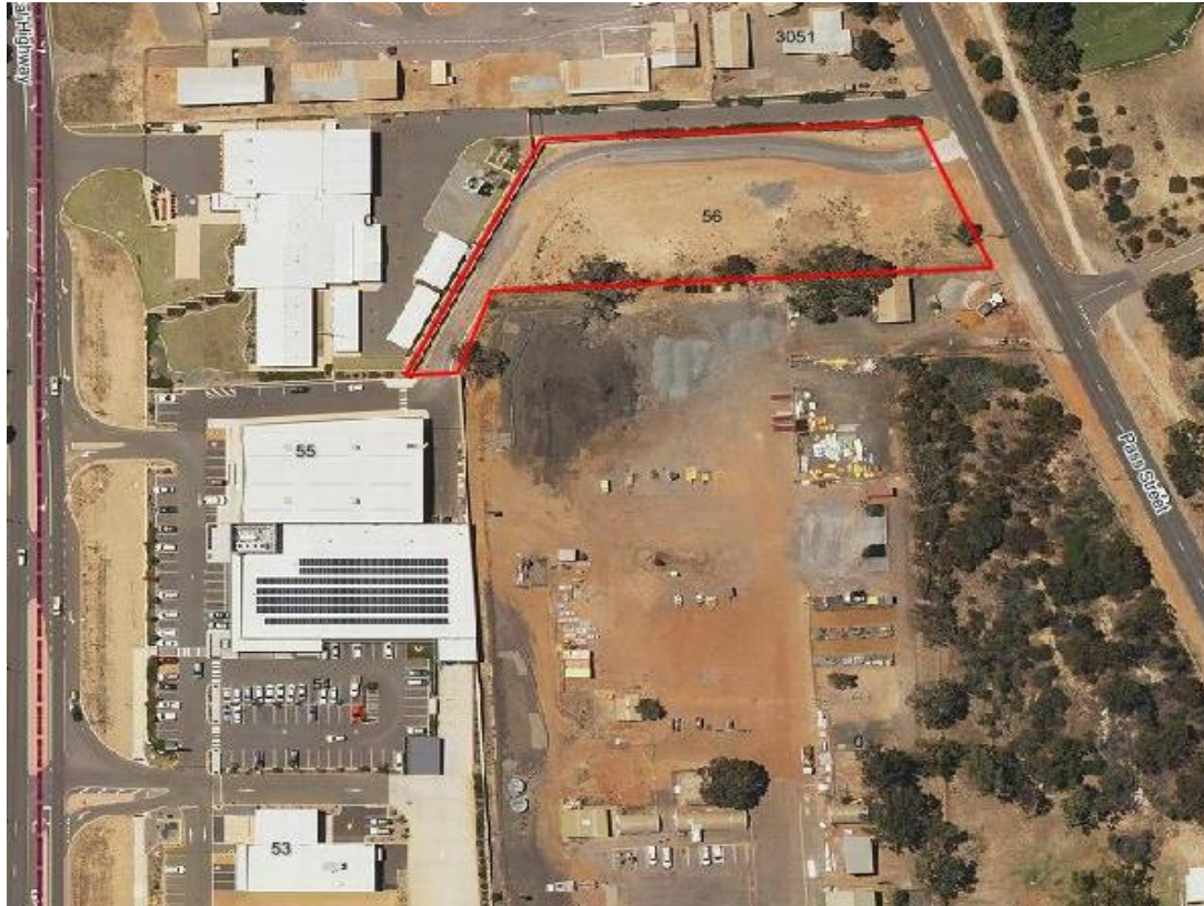
Lots 1, 2, 4, 5, 6, 7, 8, 9, 11, 12, 13, 14, 15, 17, 18, 19, 20, 23, and 9001 Airport Technology Park, Moonyoonooka