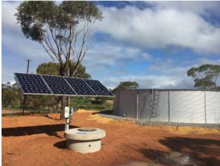
Photo of the Peter Road Facility

The total project cost, for all three sites, would be approximately $175,000, with DWER contributing $100,000 and the City contributing $75,000. Normally, Officers make a provision within the City's budget for its contribution to grant projects. However, in this case, as the grant application was made two years ago, no such allocation was made within the FY2019-20 City budget. Hence, as part of the mid-year budget review, Officers are seeking a $75,000 allocation to allow the project to proceed.