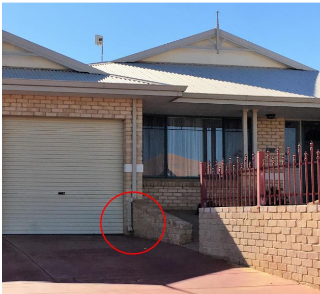
Examples of downpipes that do not comply with clause 4.1.3