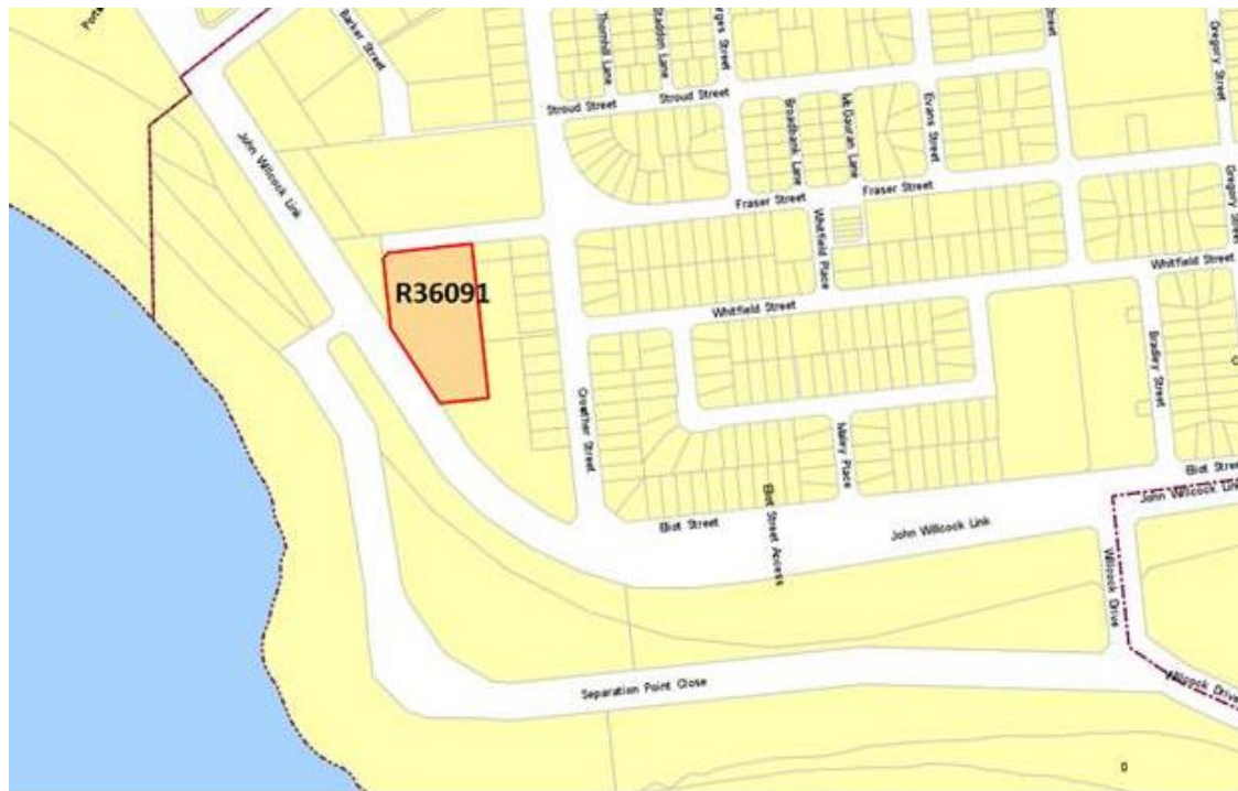
Crown Reserve 36091 (Lot 3042) – Fraser Street, Beachlands

Reserve 27953 (Lot 2349) has an area of 4.57618 hectares is reserved for the purpose of “Recreation” and is vested in the City of Greater Geraldton. The reserve lies adjacent to Crown Reserve 31961 that currently has a short-term lease with the Spalding Horse and Pony Club. The location is depicted in the plan below: