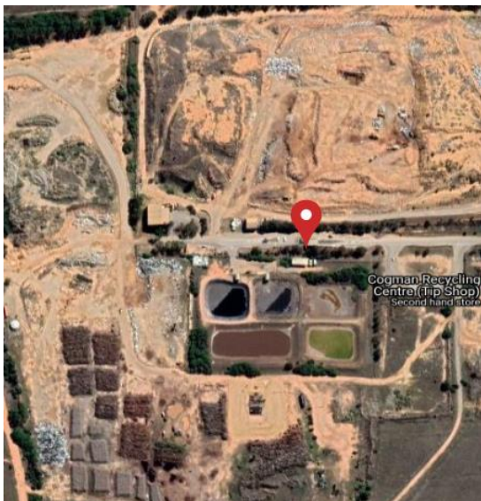
59 Landfill Lane (-28.80418589,114.66568667)