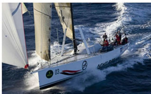
Example of race boat to be branded 'Spirit of Greater Geraldton'

Express your interest now by going to www.ayc.net.au/Geraldton