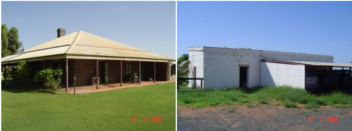
Mundabullangana Homestead and Old Post Office & Store, taken by Department staff 2008.

A site visit is needed to determine the current condition of the place.