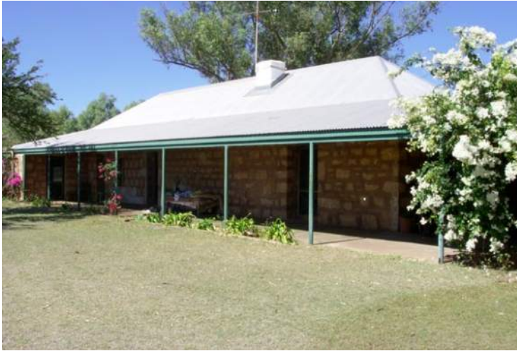
Boodarie Station Homestead, taken by Department staff 2008.