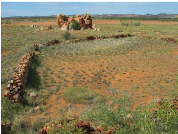
Stone yards, Shire of Roebourne (now City of Karratha) Local Government Heritage Inventory. 133

The stone yards appear to be an example of dry stone wall construction, which is particularly rare in Western Australia.