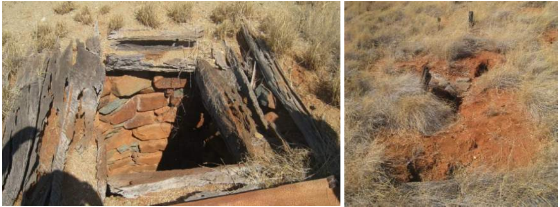
Well 52 and remains of water trough, Shire of Roebourne (now City of Karratha) Local Government Heritage Inventory 131