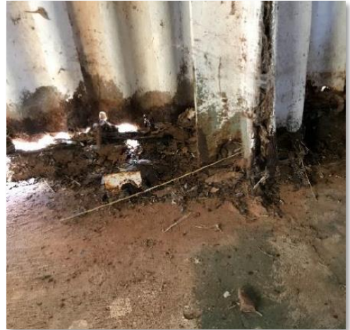
Airport Hangar 116 – structural repairs required.