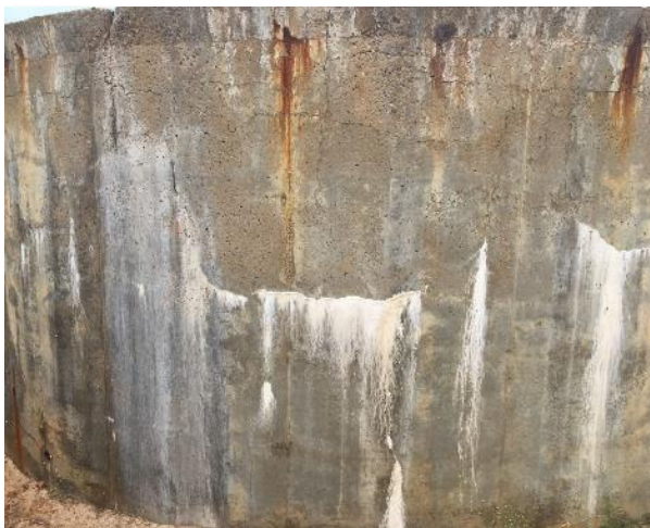
Example of corroded & leaking water tank requiring renewal for parks and gardens reticulation purposes.