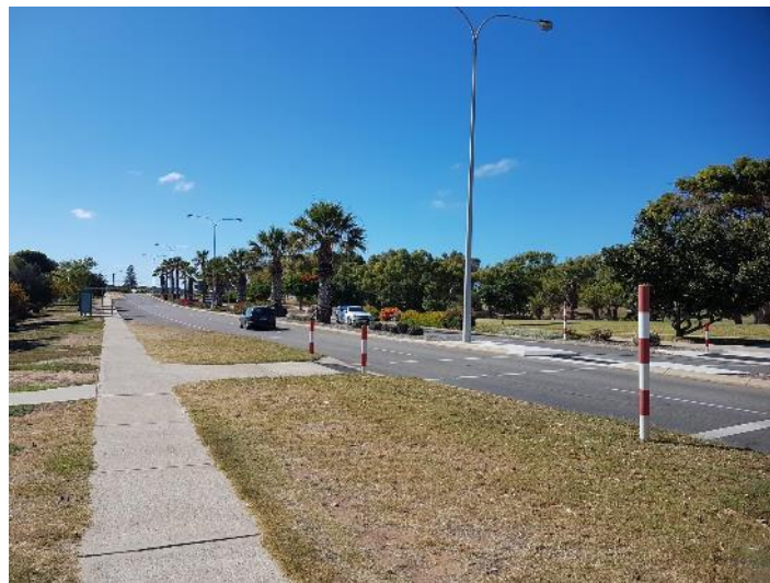
Cathedral Avenue – Median Strip garden renewal between Maitland Street and Carson Terrace High traffic area and an entry statement into the City Centre.