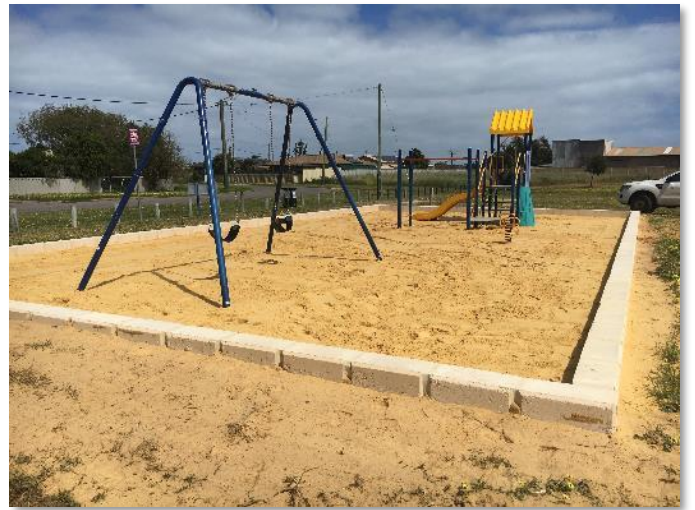
Woodman Park – an example of a successful project after limestone edging and softfall renewal