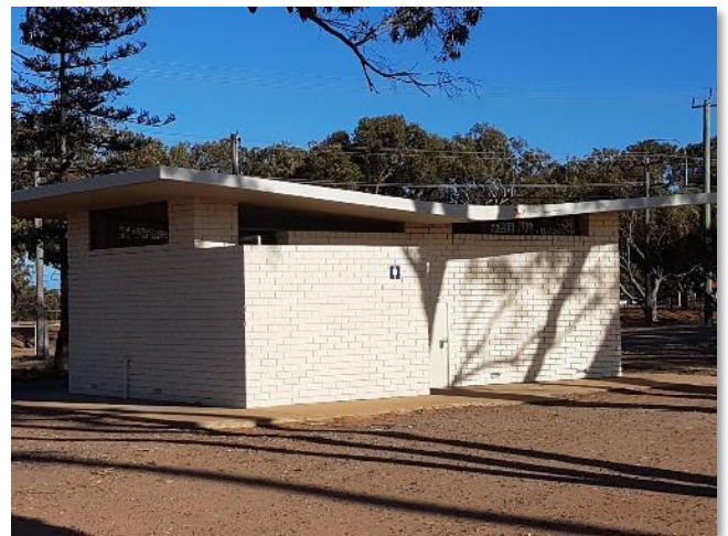
Eadon Clarke Ablutions Block – Aged & deteriorated condition of ablutions requires renewal. Heavy tourist and events use of this facility.