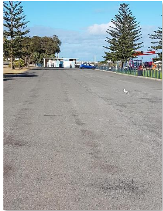
Pages Beach Carpark – surface is showing signs of wear and requires reseal and new line marking