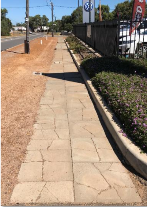
NWCH – replacement of cracked slab pavers with concrete. This will complete the path network along NWCH from Johnston St to Bunnings providing a safe route for pedestrians and cyclists.