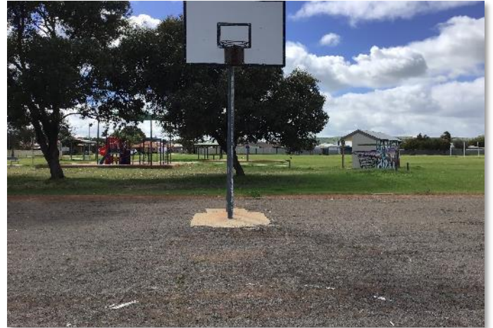
Forrester Park Basketball Court – Renewal as part of the Parks Master Plan to deliver services to the outer suburbs