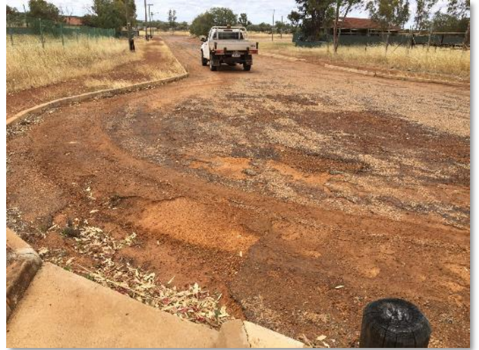
Doney Street, Mullewa – Reseal and repair road from Warren Road to cul-de-sac.