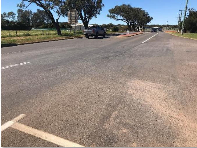
Horwood Road Utakarra – Reseal from Flores Road to Davies Road. Condition of seal is cracked and deteriorating.