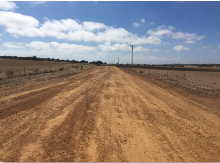
Rural Roads – After the gravel re-sheet of Hampton Road.