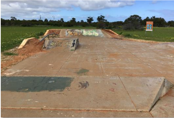
Forrester Park Skate Park - Renewal as part of the Parks Master Plan to deliver services to the outer suburbs