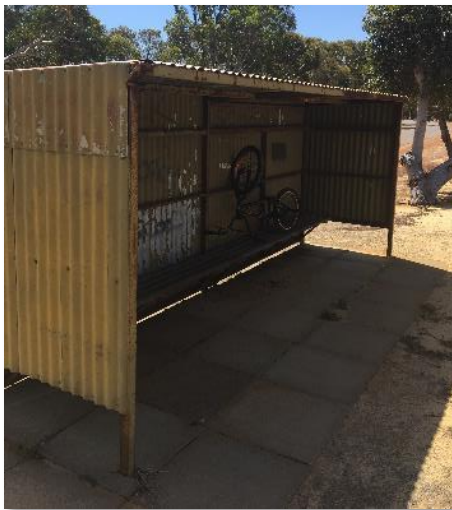
Longva Road Bus Shelter – Aged & deteriorated condition