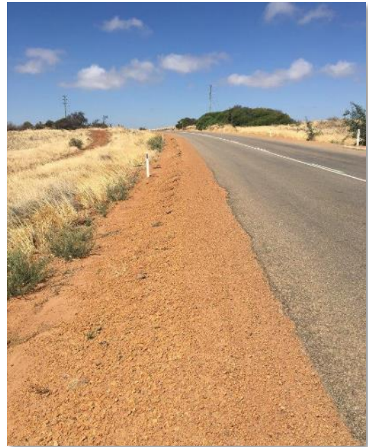
Rural Roads – Shoulder Works using Polycom to improve wearing and reduce scouring in rainfall events – photo taken 8 months after initial treatment.