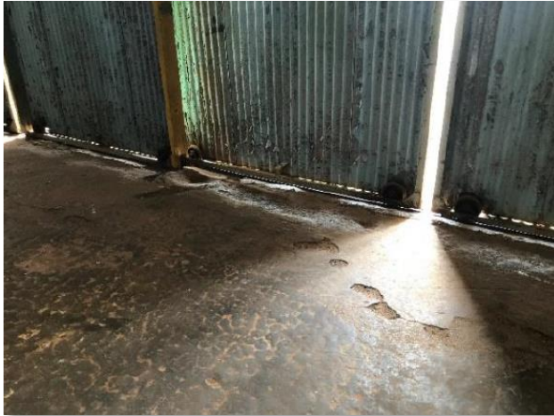
Airport Hangar 116 –hangar door renewal. Structural repairs required to concrete and hangar structure.