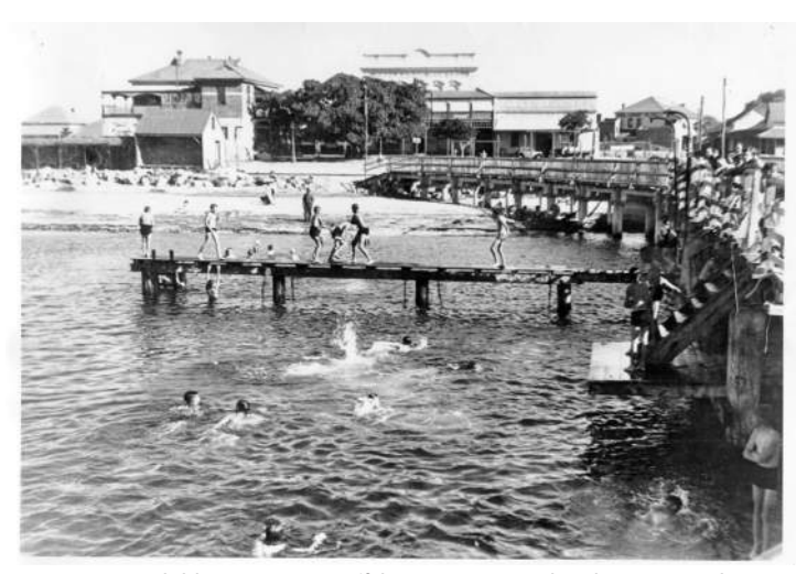
IMAGE: P825, children swimming off the jetty (p 15) Undated