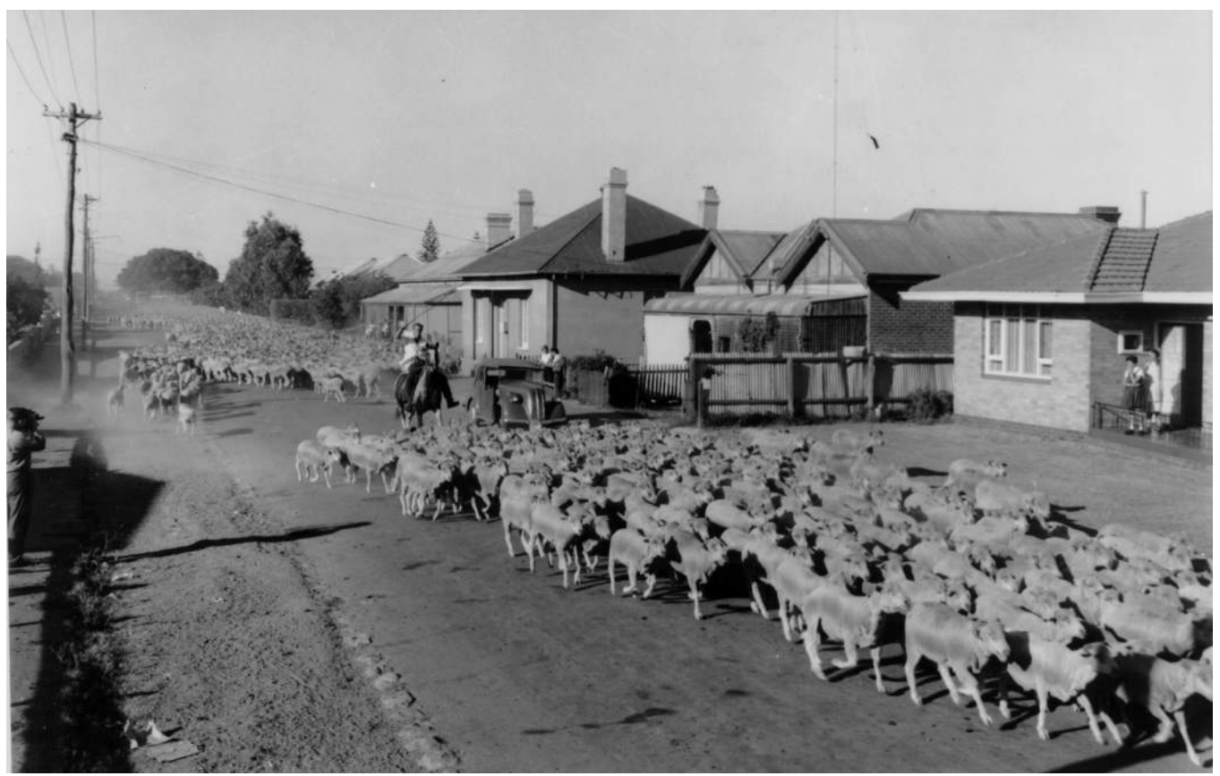
THIS PAGE: P1017, Sheep on Francis St, (p 31) April 1963, Unknown source, Courtesy of the Geraldton Regional RIGHT: Central Greenough, National Trust of WA FAR RIGHT: P619, Ships at work (p 18) c1900, Stan Gratte,

2 City of Greater Geraldton, Local Heritage, https://www.cgg.wa.gov.aulive/my-community/ local-heritage.aspx