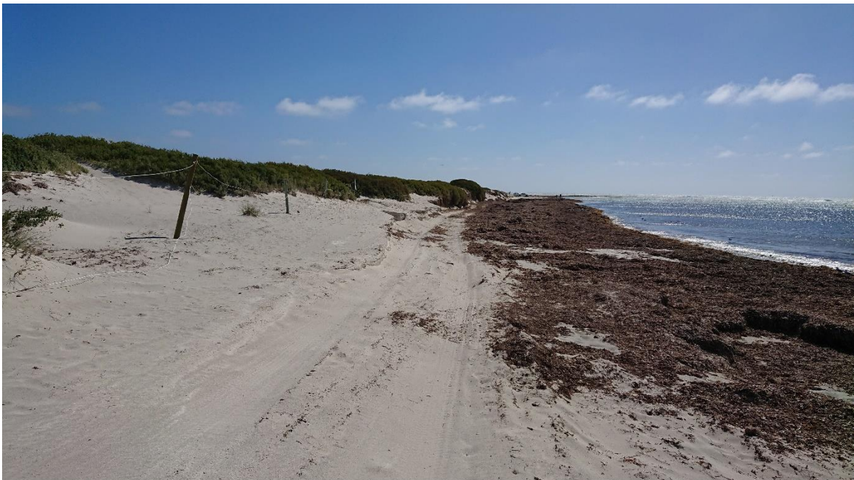
Figure 7. Photo looking west along beach (Coastal and Natural Environment team, 2018).