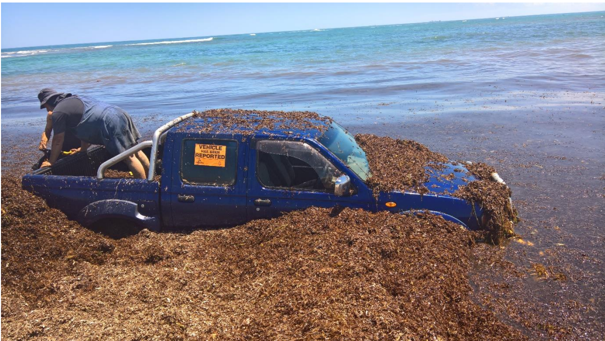
Figure 5. Submerged car in beach area identified for closure (Ranger Services team, 2017).