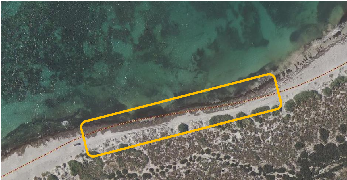
Figure 4. Beach Area identified for closure to vehicles (Intramaps, 2016).