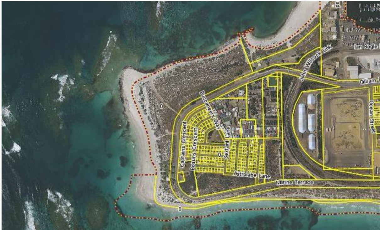
Figure 2. Point Moore settlement (Intramaps, 2016).