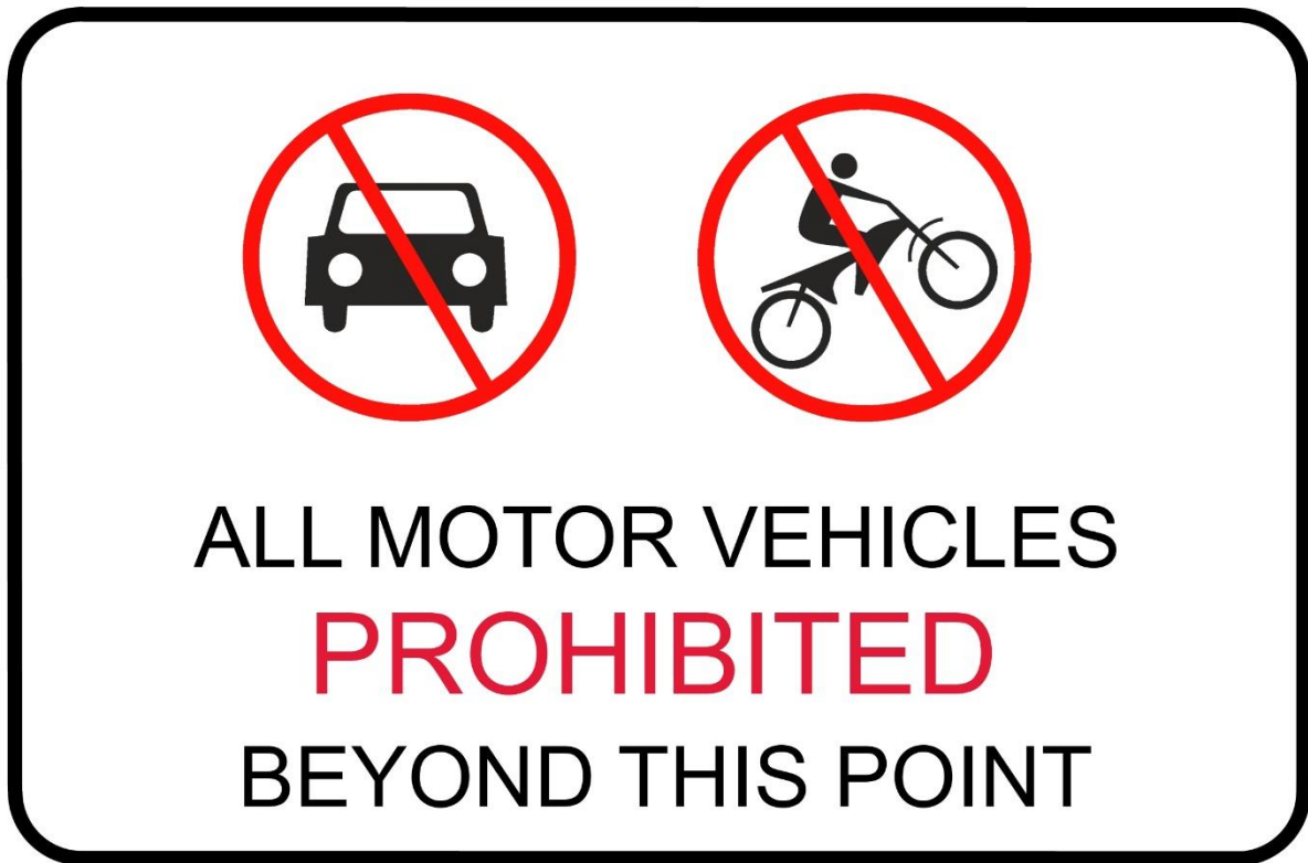
Figure 9. Example closure to vehicles signage (Sign Production team , 2018).