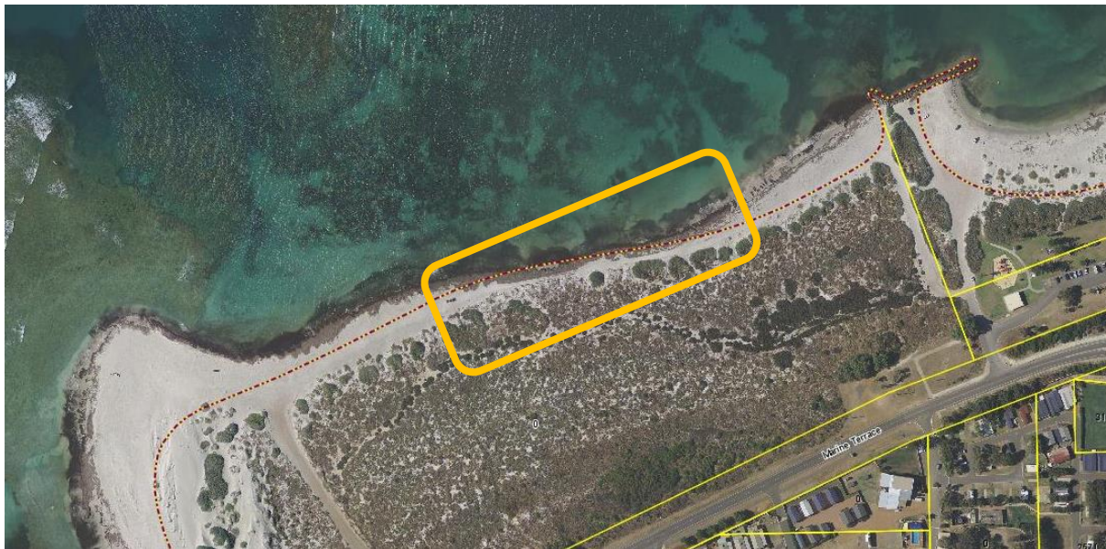
Figure 3. Pages Beach to Explosives – closure area outlined. (Intramaps, 2016).