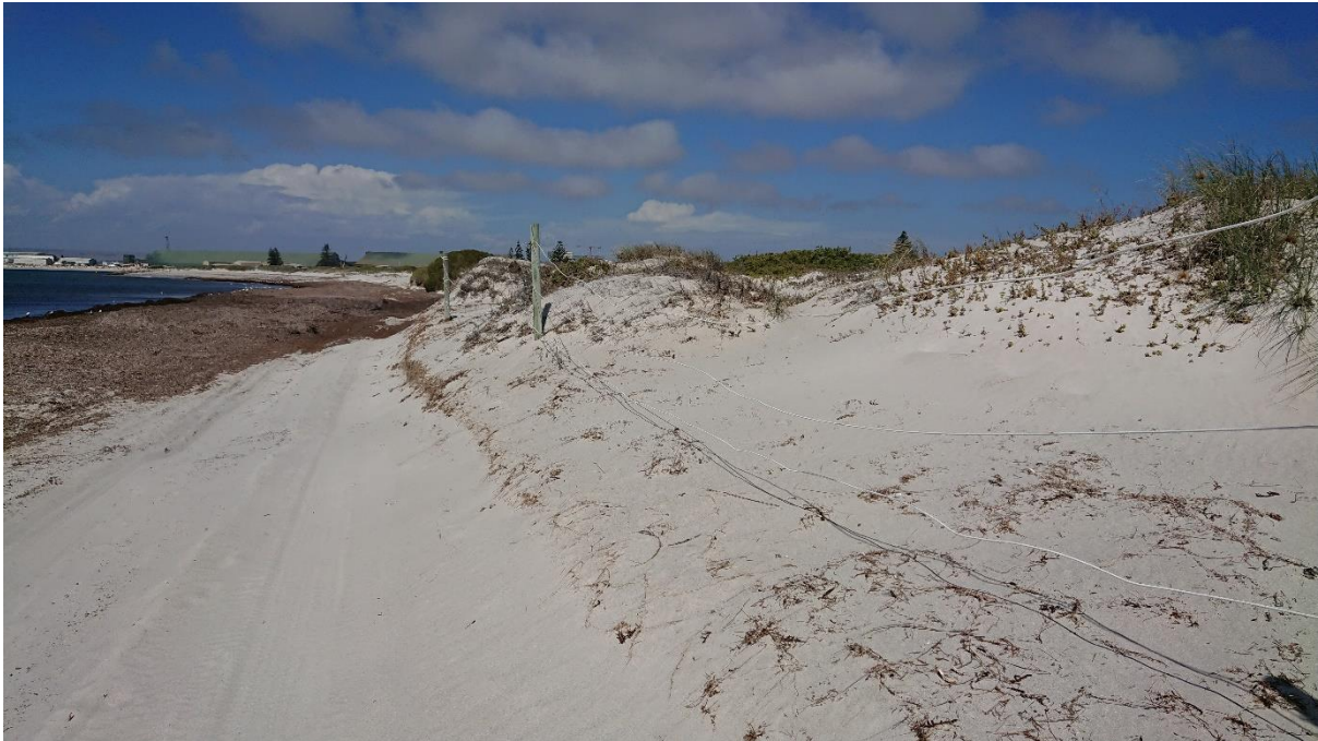
Figure 6. Photo looking east along beach (Coastal and Natural Environment team, 2018).