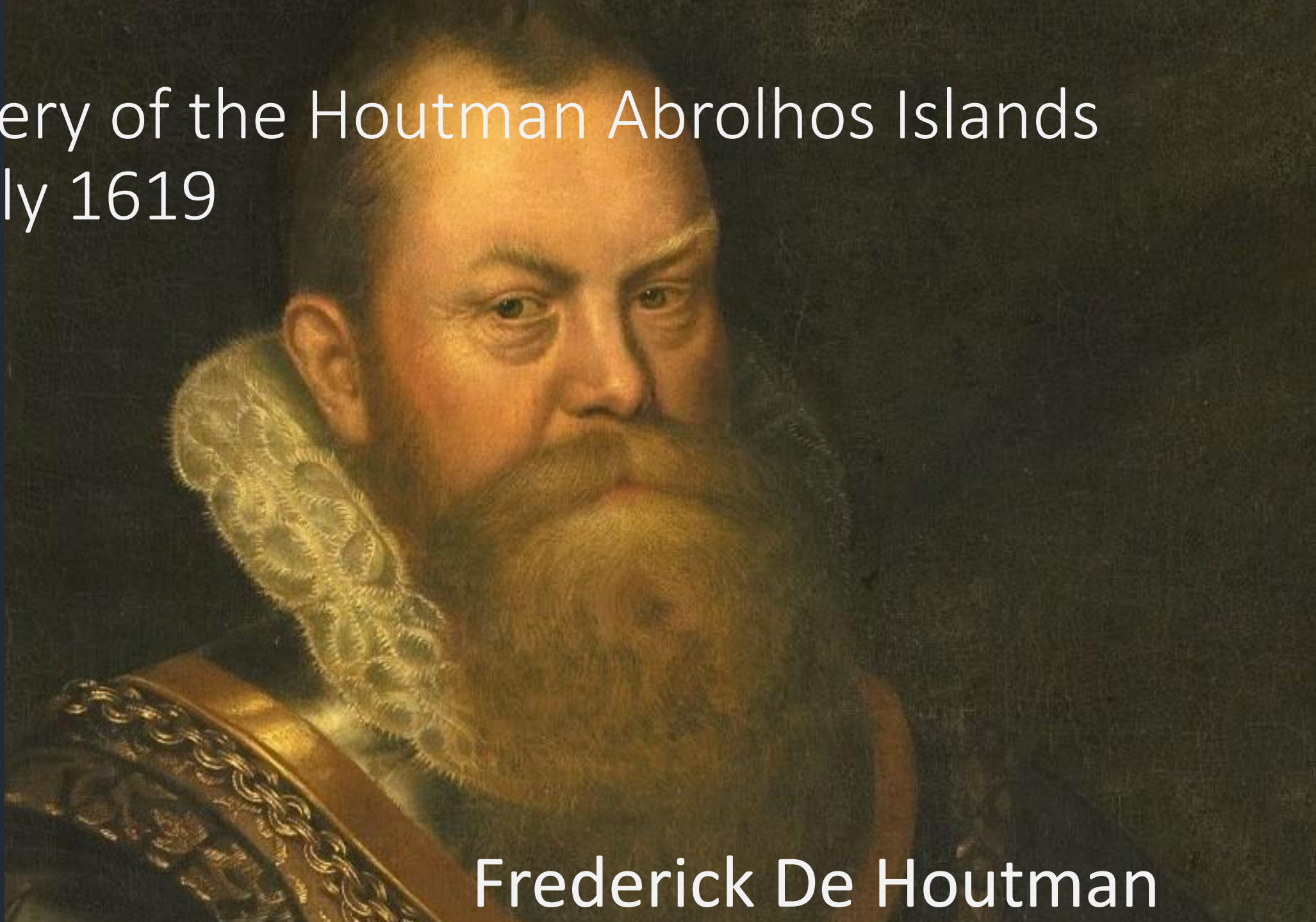
Frederick De Houtman

Discovery of the Houtman Abrolhos Islands 29 th July 1619