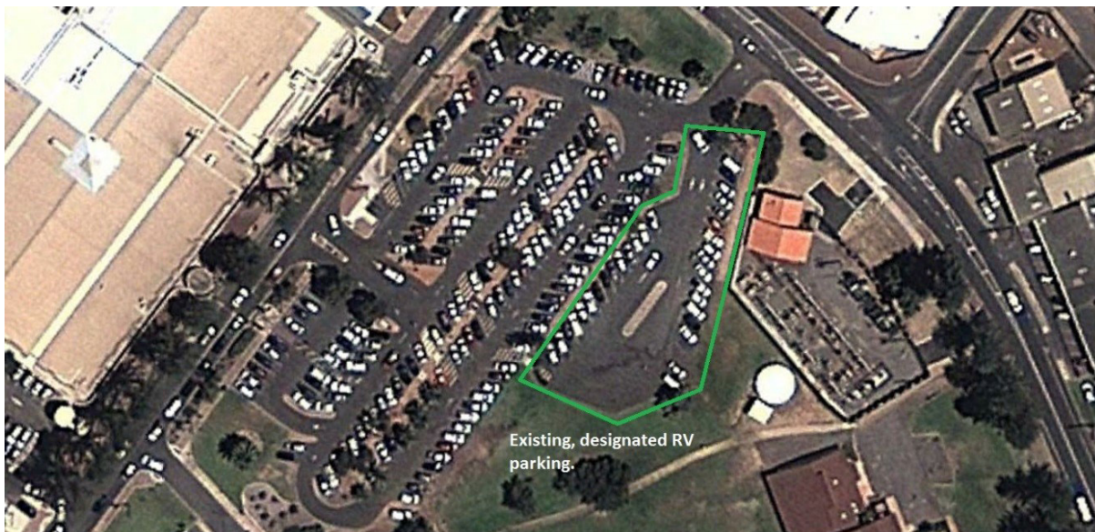
Map 3: CGG carpark No 5, designated RV parking

2.3.1 CGG carpark No 5, opposite Stirlings Centre. See Map 3.