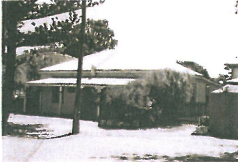
Front facade of the two houses.