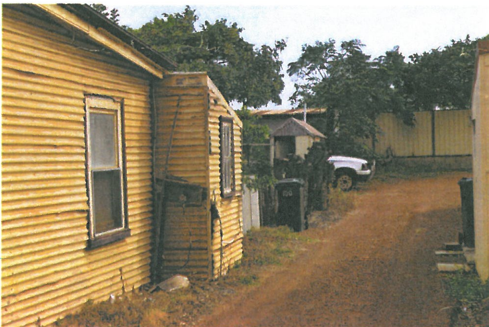
Dilapidation East Side