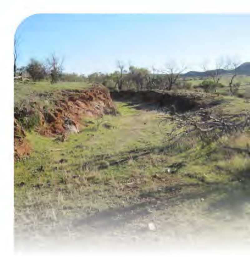
ABOVE: Railway cutting, Howatharra

Once the period for comments has closed, the Heritage Council will consider whether to recommend the finalisation of registration to the Minister for Heritage, who will make the final decision on whether a place is entered in the State Register.