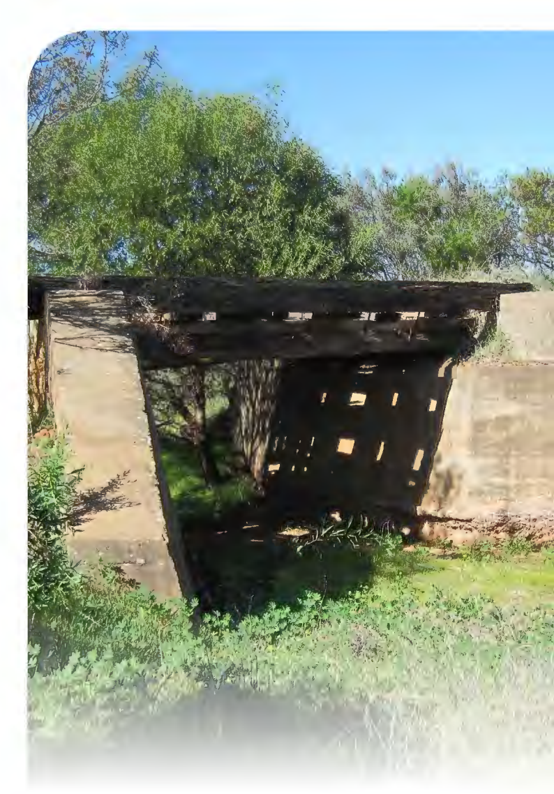
ABOVE: Concrete bridge, White Peak

Entry in the Register will recognise and celebrate the distinctive heritage values of the railway precinct and will offer protection under the Heritage Act 2018 , ensuring any major changes proposed for the place are in keeping with its cultural heritage significance.