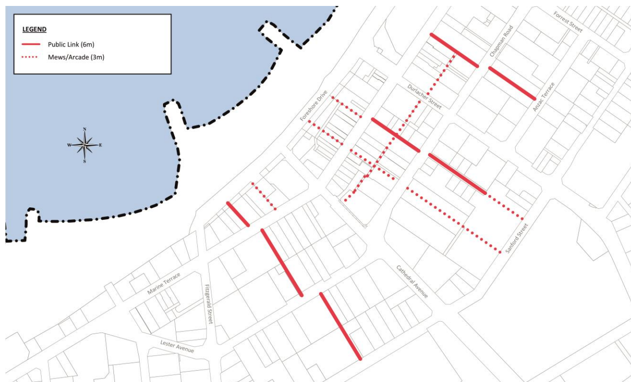
Figure 12 – Pedestrian links