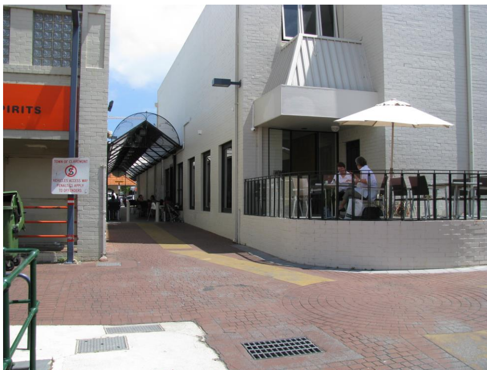
Figure 14 – An example of how to transform a service lane into a people lane (Lemon Lane, Perth – The former service lane has been partially covered and bollards installed to prevent vehicular traffic. The coffee shop has installed large windows along its side frontage to the former service lane to act as additional shopfront and to make the area visually larger and permeable. The covered area has alfresco dining and acts as a social place while still allowing pedestrian through traffic).