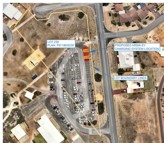
Revised EV Charging Station Proposed Location

After further consultation, a revised location further north within the same car park was identified and deemed more suitable.