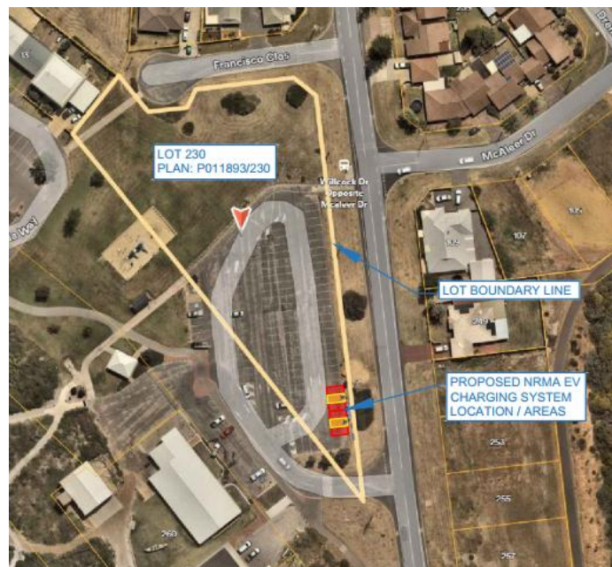
Initial EV Charging Station Proposed Location

City Officers reviewed the initial proposed location and noted its proximity to an existing plastic and cardboard recycling hub, which is regularly accessed by waste collection vehicles. Given the operational requirements of the recycling hub, the proposed location of the EV charging station was not found suitable to support the access needs of the waste collection zone.