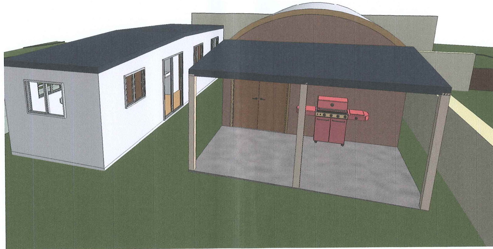
1 3D View 4