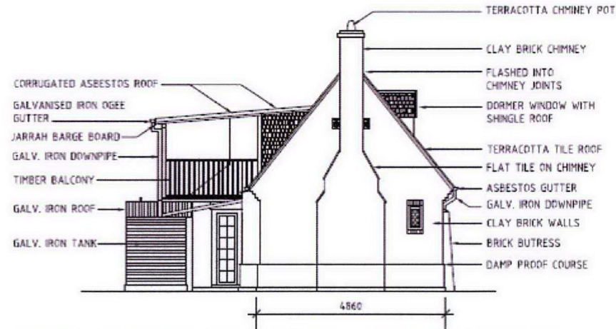
EXISTING EAST ELEVATION - THE HERMITAGE SCALE 1:100

Please note that all drawings and dimensions are a representation only. Wall thicknesses vary along the wall length and height. The measurements shown are an estimation of average thickness and height. Likewise, walls are not straight, vertical or parallel, and drawings are an estimate of the average. Site information is also only representative, with the location of ALL services being only approximations.