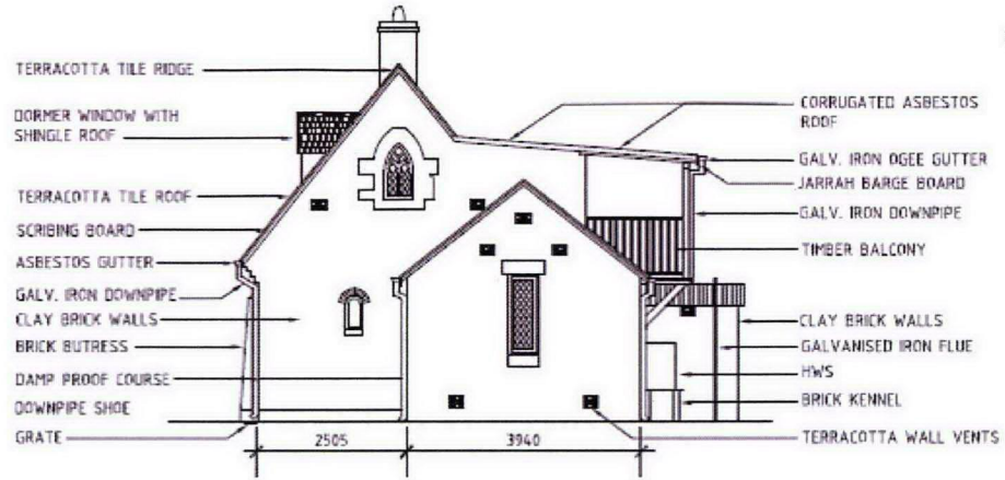
EXISTING WEST ELEVATION - THE HERMITAGE SCALE 1:100