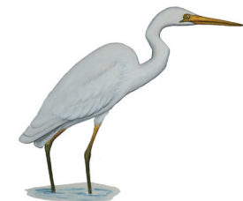
Eastern Great Egret

Look for Eastern Reef Egret, Caspian Tern and Great Egret near the river mouth. Pied Cormorants roost along the river.