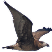
Immature Pacific Gull

Over the years, increased human activity has meant reduced bird activity but Point Moore, Grey's Beach and Back Beach offer good opportunities to see Osprey. There are man-made nesting platforms at Point Moore, Greys Beach & Separation Point. Other possibilities are Nankeen Kestrel, Pacific Gull, Ruddy Turnstone, Sanderling and Red-capped Plover.