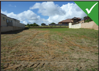
Example of correctly slashed vacant residential lot.