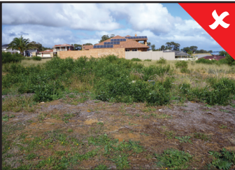
Vacant residential lot showing grass and wattle regrowth requiring slashing/mowing.