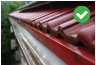
Well maintained gutter, clear of flammable material.