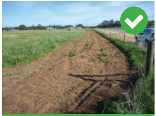
Property boundary showing a wide, clear boundary firebreak