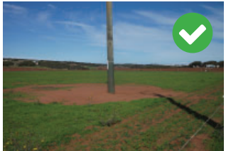
Power pole cleared 3m around base.