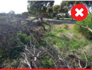
Property boundary with high levels of flammable material and no visible firebreak.