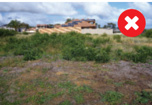
Vacant residential lot showing grass and wattle regrowth requiring slashing/mowing.