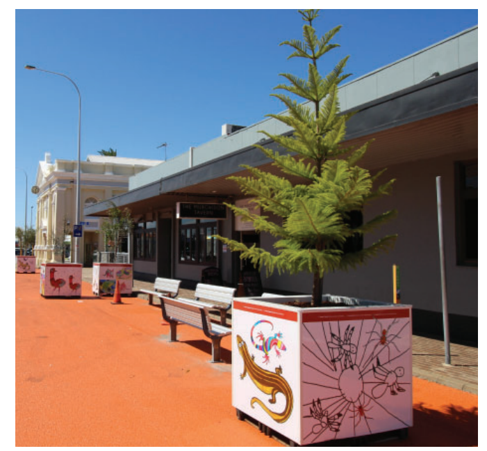
Tree planter boxes featuring artwork from local students