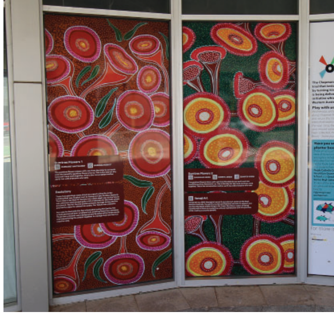
Artwork featured along Chapman Road

The City has allocated $100,000 from the City Centre Revitalisation Budget to redesign the activation area and undertake the works to implement the revised design. The works will be carried out by City staff and annual supply contractors.