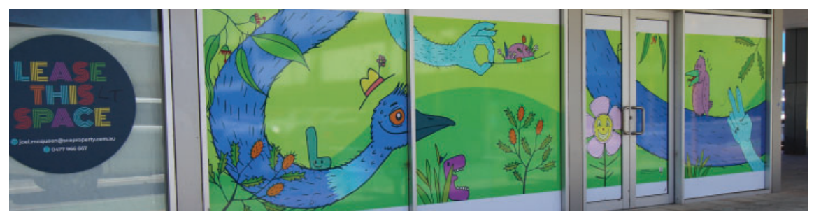
Interactive Critter Art Trail artwork