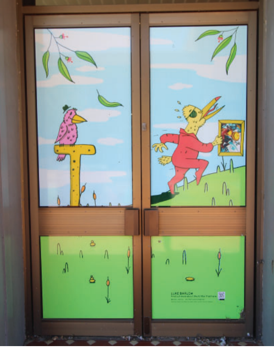
Interactive Critter Art Trail artwork