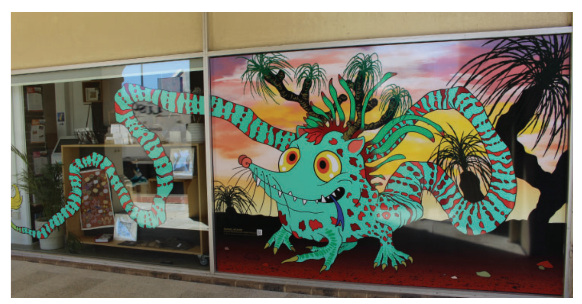
Interactive Critter Art Trail artwork

These works will take approximately two weeks to complete and will require single lane closures at various times. Pedestrian and vehicle access to local businesses or organisations will not be affected by the works. Once a schedule of works has been finalised, the community will be informed of the start date of the on-ground works.