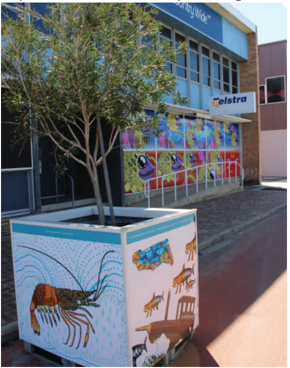
Tree planter boxes featuring artwork from local students