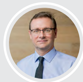
JOHN O'SULLIVAN Tourism Australia