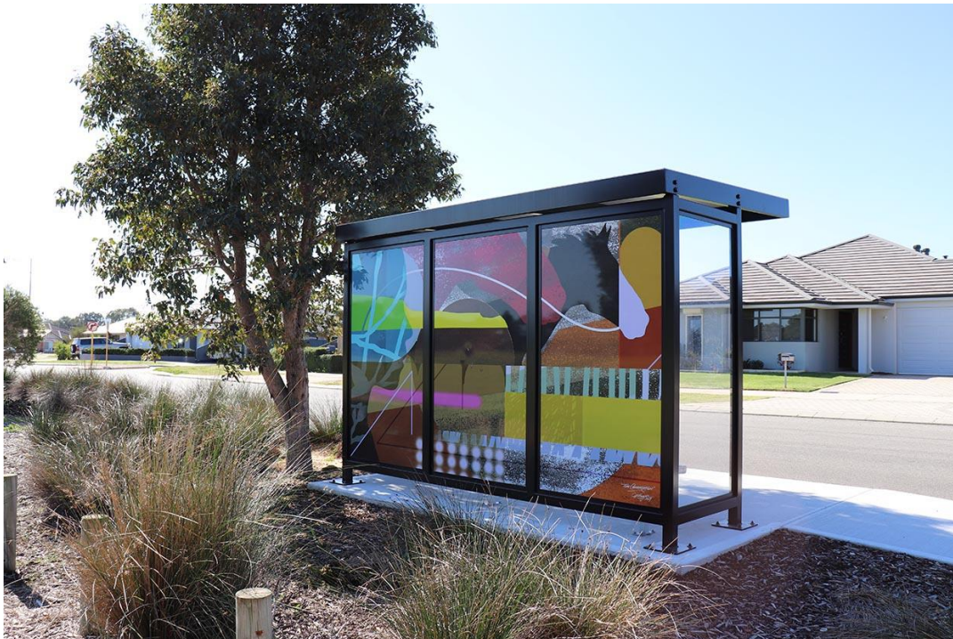
Figure 2: