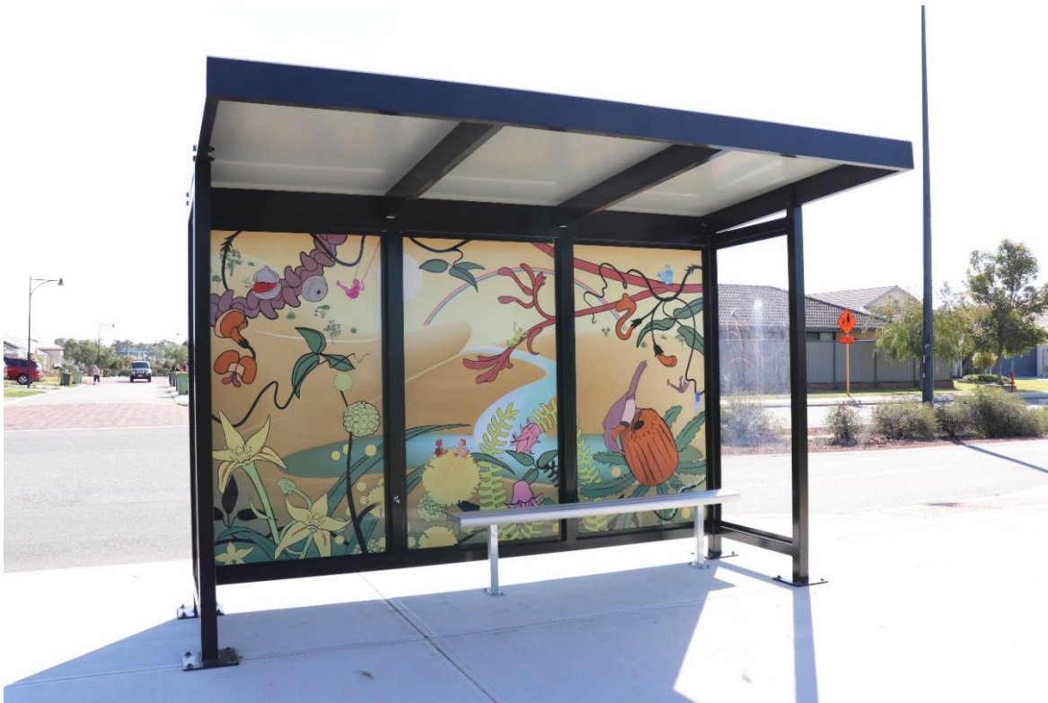
Figure 3: This photograph has been reproduced with authorization from JSM Jason Signmakers.

Disclaimer: The artwork displayed above is protected by copyrights and cannot be reproduced without the consent of the artists.