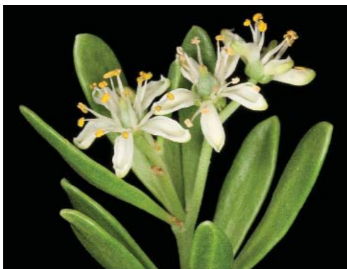
NITRE BUSH - Nitraria billardierei