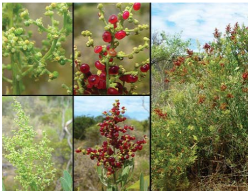
RED BERRY BUSH - Rhagodia preissii sbsp. obovata