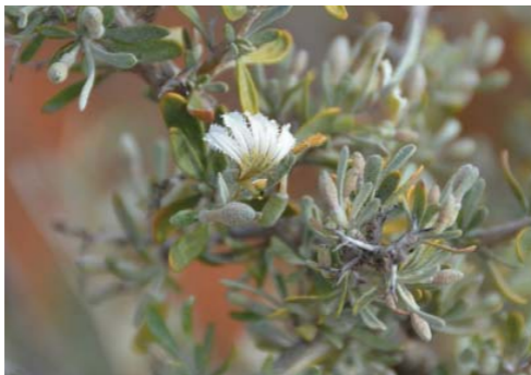
CURRENT BUSH - Scaevola spinescens