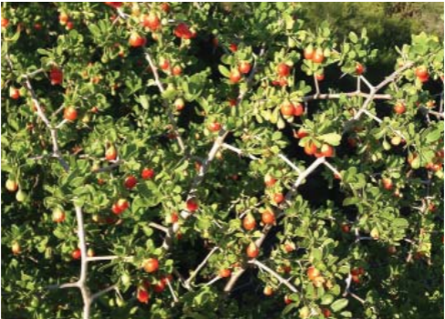
AFRICAN BOXTHORN - Lycium ferrocissimum