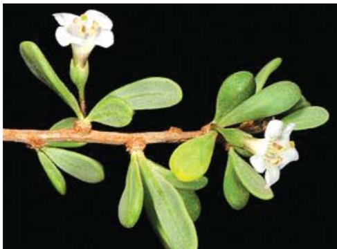
AUSTRALIAN BOXTHORN - Lycium austral