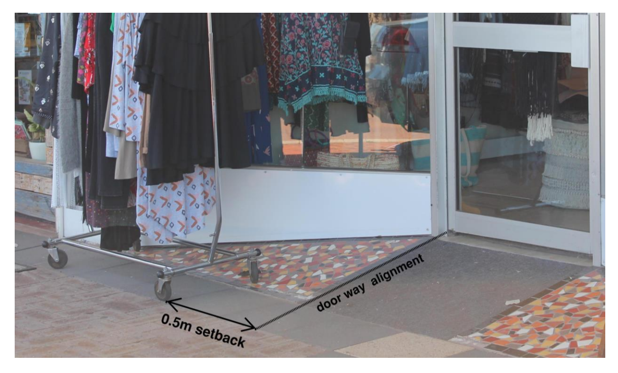
Figure 1 – Required setback of activities, objects and furniture from the door way.