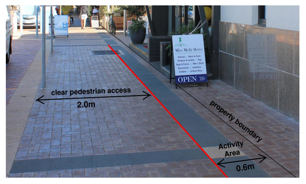
Figure 5 – Marine Terrace northern side from Cathedral to Fitzgerald Street - designated clear pedestrian access location and width.