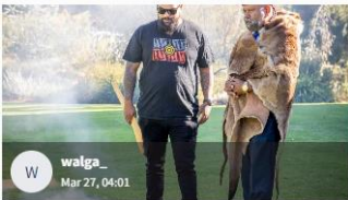
Last week, WALGA hosted our annual Aboriginal Engagement Forum at the State Reception Centre, Kaarta Gar-up (Kings Park). Returning in 2024 with an elevated look and feel, the event commenced with a