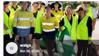
On Tuesday March 5 Team WALGA cleaned up Railway Parade (home of the WALGA office), collecting 31kg of waste and 53 beverage containers! WALGA is part of the Keep Australia Beautiful Council's Adopt a Spot Program