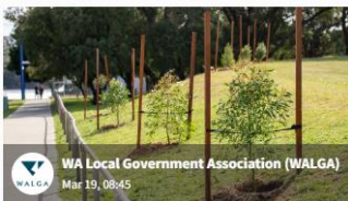
From today, Local Governments throughout the Perth and Peel regions will share in $591,839.32 worth of funding under the first round of the Urban Greening Grants Program. "This is a terrific start to the Urban