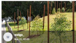
Local Governments throughout the Perth and Peel regions will share in $591,839.32 worth of funding under the first round of the Urban Greening Grants Program. "This is a terrific start to the Urban Greening Grants