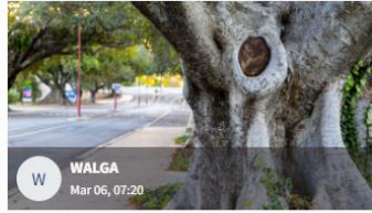
Local Governments taking the lead to protect mature trees on private land WALGA has today released a new Model Local Planning Policy (LPP) to support Local Governments to stem the loss in tree canopy cover in