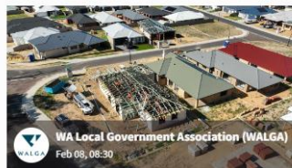
As Western Australia experiences a brutal 3-day heatwave, we are reminded we need Cooler Cities and Shadier Suburbs. We need more tree canopy. In WA we are losing trees and at a rate faster than we can replace