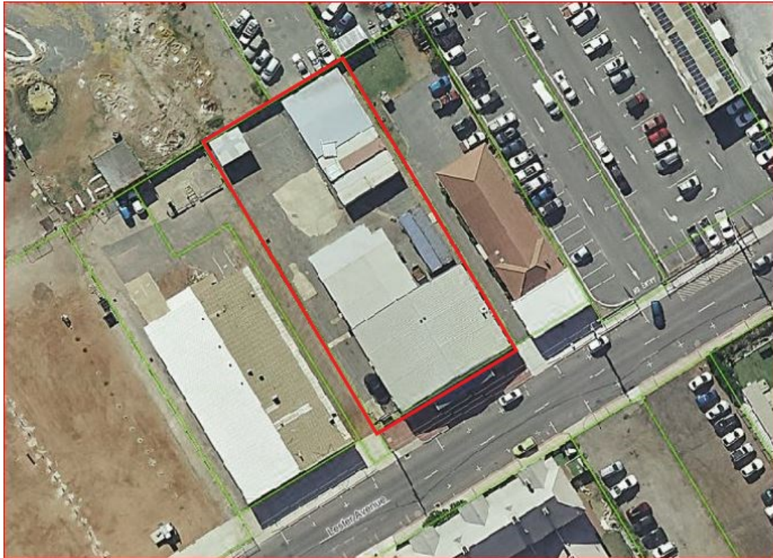
Lot 100 (204) Lester Avenue, Geraldton

Expressions of interest to commercially lease the property were advertised in February 2024 and the building is offered on an 'as is' basis and any upgrades or refurbishment required to support business activities will be at the cost of the lessee.