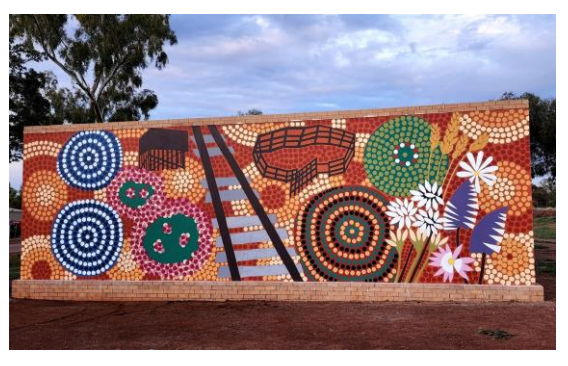
Mullewa Entrance Mural by local Artists, 2022