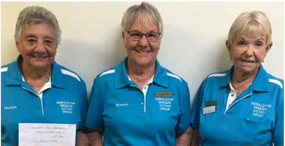
Seniors Action Group tournament winners.

Our sympathy to those who have lost a loved one recently and best for a speedy recovery to members are ill.