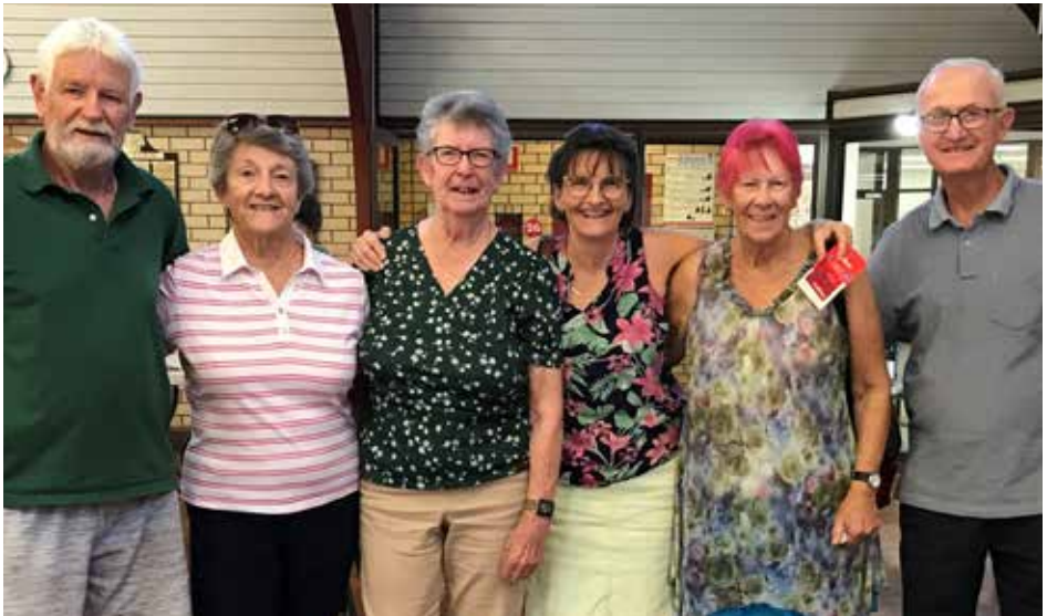
Seniors Action Group quiz winners.