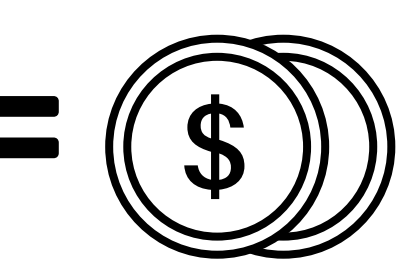
To calculate the rate in the dollar