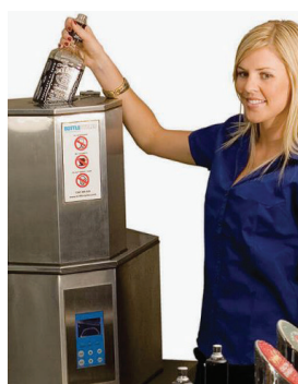
Bottle crusher in action.

Here's a terrific Melbourne invention that reduces glass to landfill and makes hospitality venues more efficient. It's a glass bottle crusher that sits quietly in the corner and can chew through 80 bottles a minute and stores up to 300 of them. The glass is then recycled and turned into new bottles. As an example, 8000 kilograms of recycled glass is the equivalent to saving 5 tonnes of carbon dioxide, 19,500 litres of water and there's around 19 cubic metres of landfill.