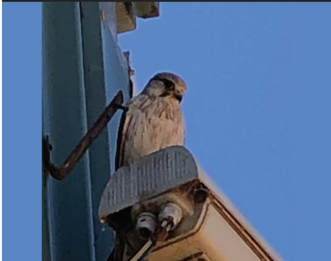
Even the wildlife enjoys dropping in for a bargain!