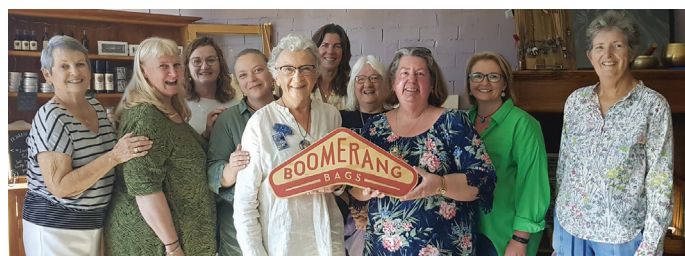
The Gero Boomerang Bags volunteers celebrating 6530 + Bags.

A big shout out and congratulations to our local Geraldton Boomerang Bags volunteers for the milestone of having created 6,530 (our postcode) reusable bags for the community, helping folk say no to plastic alternatives. We can all help make a difference in some small way. Boomerang Bags are found all over our fine City!