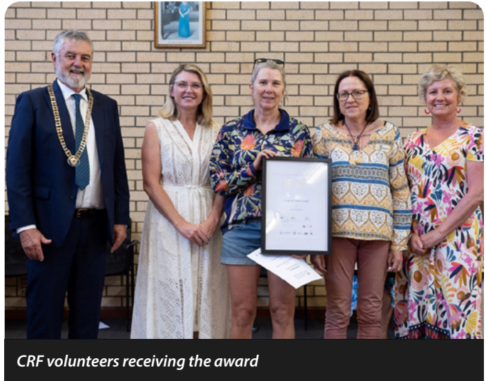
CRF volunteers receiving the award