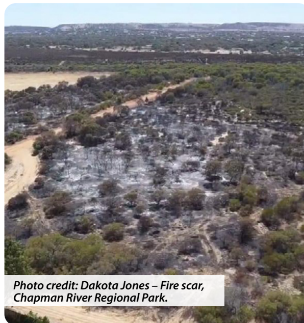
Fire scar, Chapman River Regional Park.

WATCH OUT FOR WILDLIFE! Now that the weather is warming up, please be mindful of wildlife on the move.