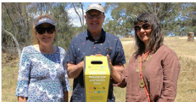
Chapman River Friends volunteers