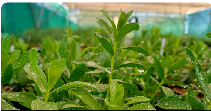
Community Nursery seedlings.

The Community Nursery has recently welcomed new officer Nina to the team. The Community Nursery collects native provenance seed and propagates them alongside a team of volunteers for City revegetation projects. Check out the Community Nursery's website page including volunteer information here