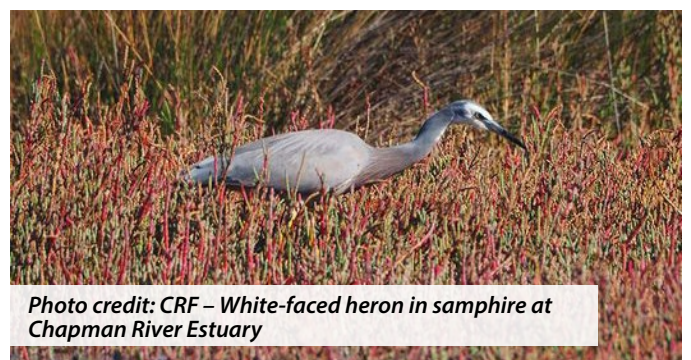
White-faced heron in samphire at Chapman River Estuary