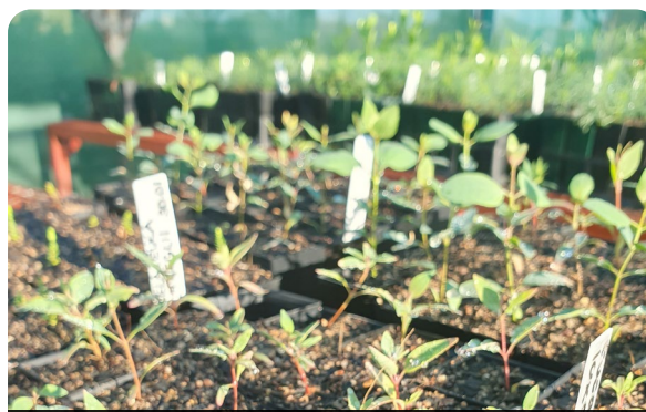
Community Nursery seedlings.

A fire was deliberately lit at the Chapman River Estuary along Crowtherton Street.