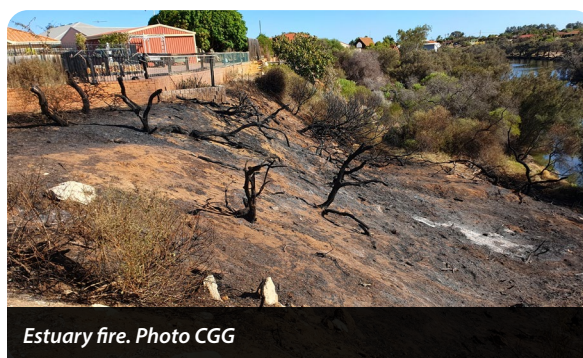
Estuary fire.