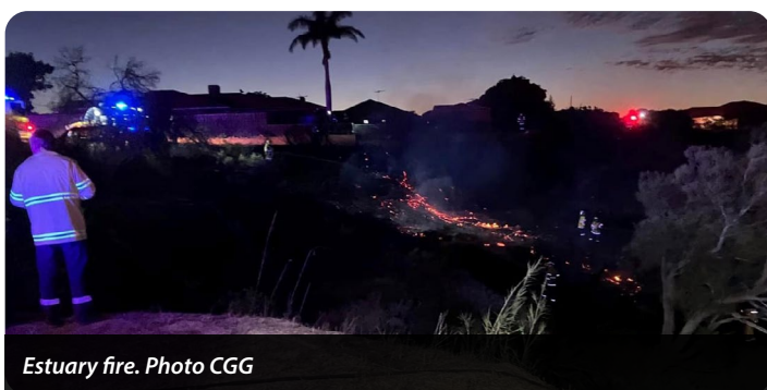
Estuary fire.

A fire was deliberately lit at the Chapman River Estuary along Crowtherton Street.