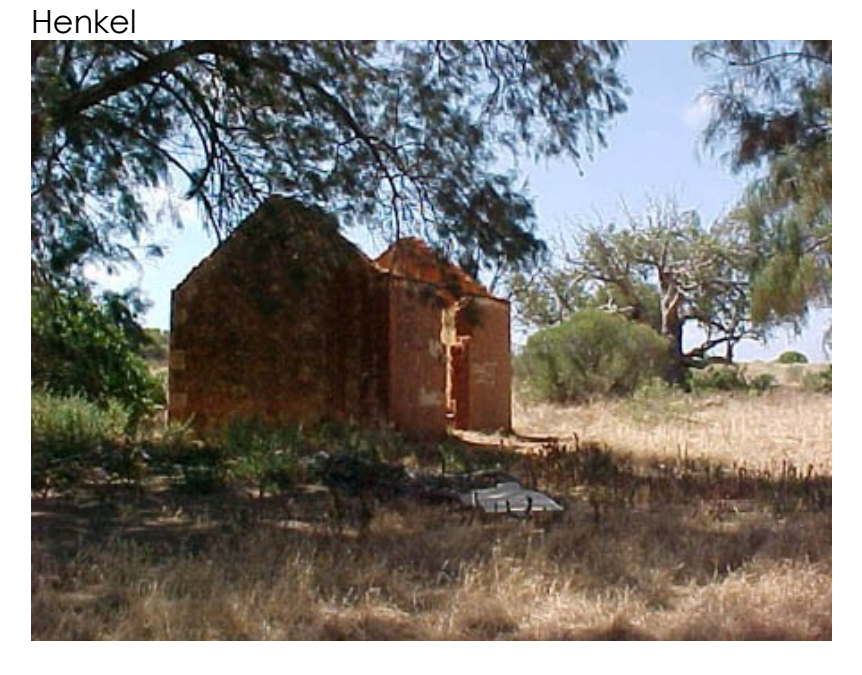
Photo Description: 9/12/1997 Suba, Callow and Grundy Riverside Cottage, prior to further deterioration