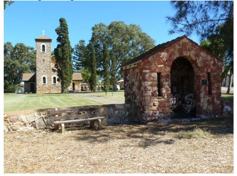
Photo Description: 13/04/2008 Tanya Henkel View of the stone lychgate from Chapman Road.