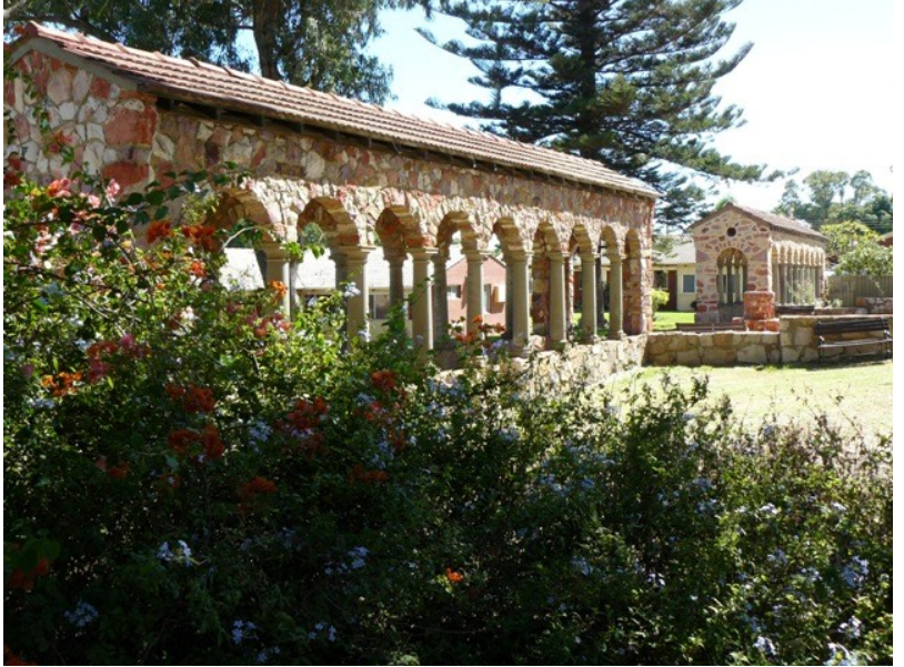
Photo Description: 13/04/2008 Henkel View of the Colonnade looking north.

13/04/2008 Tanya Henkel <u>The stone Colonnade is located to the west of the church.</u>