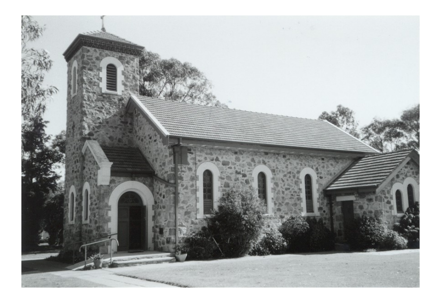
Photo Description: 29/10/1996 Suba, Callow & Grundy St George's Anglican Church.