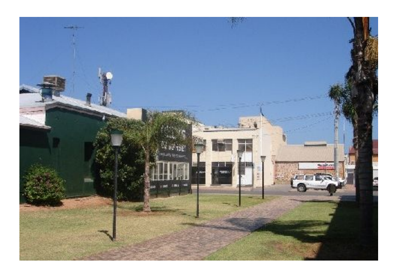
Photo Description: 15/01/2008 Rod Milne Park situated between the Murchison Tavern and Fmr Town Hall.