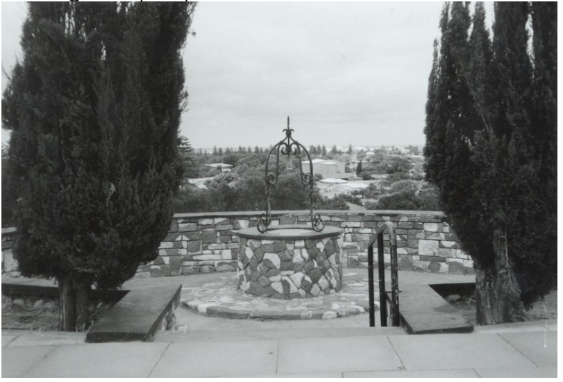
Photo Description: 5/12/1996 Suba & Grundy View of Wishing Well over Geraldton.